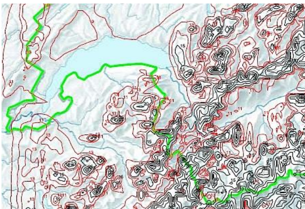
Figure 1 : Probable maximum precipitation (PMP) in Switzerland, at ground mm/h, duration : 24h (extract) - © OFEG and EPFL-EFLUM-H&L.

The results have shown that the used models could give realistic values, but should be considered as intermediate results. Research still hasn't concluded in this domain, however it was possible to elaborate PMP maps of Switzerland (Figure 1). A comprehensive methodology that is applicable to alpine catchment areas is still missing.